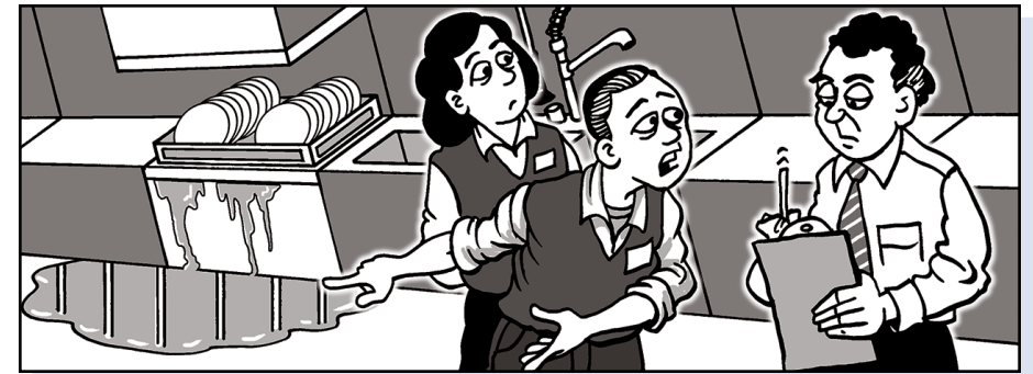
The law protects you when you speak up about safety.