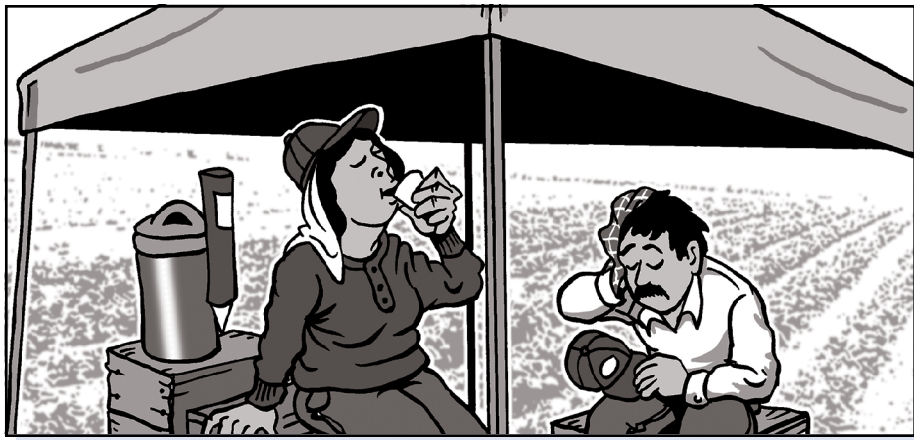
Employers must provide what is needed to keep you safe.

Cal/OSHA regulations describe what employers must do to protect workers from specific hazards. These regulations can be found in Title 8 of the California Code of Regulations, and on Cal/OSHA's website at dir.ca.gov/samples/search/query.htm . Employers have to follow these laws and regulations, or Cal/OSHA can fine them.